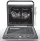
Universal S9 Ultrasound

800.842.0607 | www.universalimaginginc.com