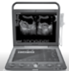
Universal S9 Ultrasound

800.842.0607 | www.universalimaginginc.com